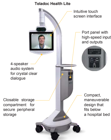
Teladoc Health Lite top-of-the-line audio and video capabilities, coupled with immersion design allows WTI's medical healthcare volunteers to provide sustainable medical expertise to vulnerable communities all over the world.

As WTI's primary corporate sponsor, Teladoc Health contributed approximately $700,000 of support in 2020, including both direct funding and in-kind technology and professional time to WTI. We are so grateful for this partnership!